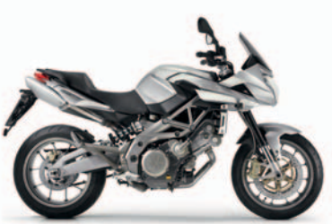
SHIVER 750 GT

Make your Shiver 750 or Shiver GT 750 even more unique with original Aprilia accessories. A comprehensive and constantly evolving range to satisfy all tastes and desires, with an unmistakable style and superior quality. Tail bag, tank bag, semi-rigid water resistant panniers and centre stand to cater for diverse load and travelling needs of Shiver GT. Akrapovic exhausts, front fender and ignition key cover in carbon fibre, crash pads and adjustable licence plate holder for an even more involving sports experience. Aluminium mirrors and many other premium components for enhanced, totally customisable looks